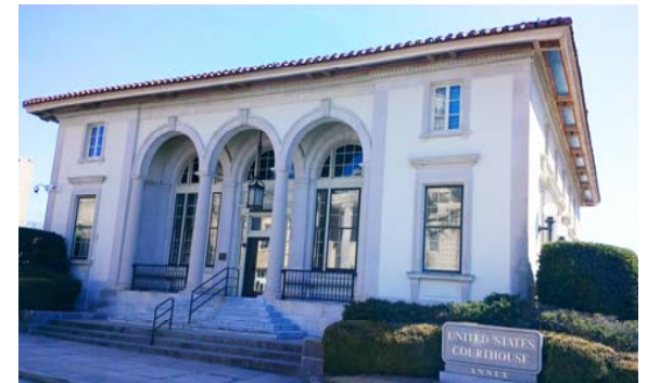
STAR court sessions are held in the U.S. Courthouse Annex, at 215 South Evans Street, in Greenville, North Carolina.

FOR MORE INFORMATION ABOUT THE STAR PROGRAM, TALK WITH YOUR SUPERVISING PROBATION OFFICER.